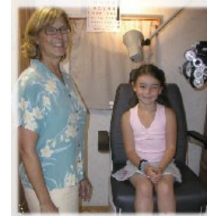
Child receiving eye exam.

If the screening detects the possibility that a child may have a vision problem, the parents of the child are notified and informed accordingly. It is imperative that the parents set up an eye exam with an eye professional as soon as possible. If there is a financial problem to cover the exam and treatment for which Medicaid or other state programs are not applicable, the Lions Club conducting the screening or NMLOKS, Inc., will assist with funds.