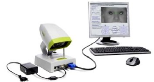
PlusOptix S09 System

The screening process is non-invasive, simple and quick. The child's head is placed in front of the PlusOptix S09 camera and a digital picture is taken. The pictures are evaluated real-time to determine if there may be a vision problem.